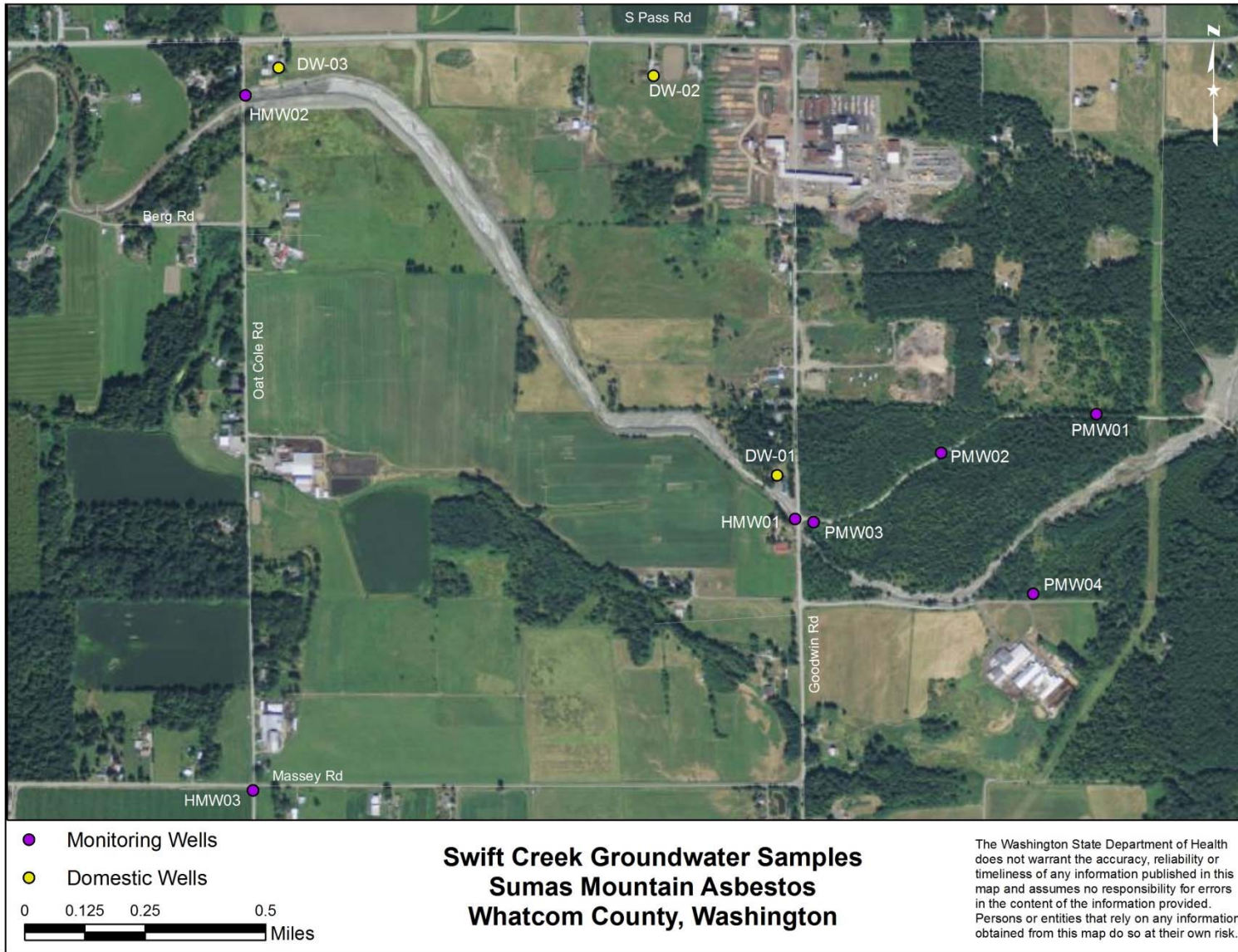
Figure B-1: Swift Creek Groundwater Sampling Locations, Swift Creek, Whatcom County, Washington