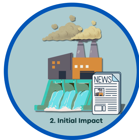
2. Initial Impact

A newspaper announces that a manufacturing plant is relocating to the community, but the information is not available in the primary language of the community, so they are unaware of the potential hazards from living near the plant.