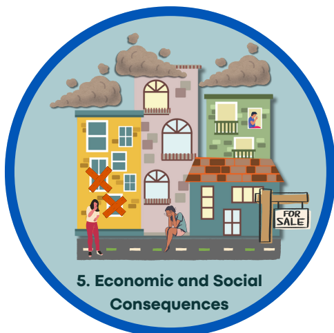
5. Economic and Social Consequences

A newspaper announces that a manufacturing plant is relocating to the community, but the information is not available in the primary language of the community, so they are unaware of the potential hazards from living near the plant.