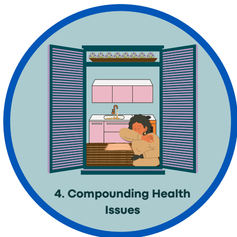
4. Compounding Health Issues

Medical issues worsen within the community due to compounded effects of asthma, poor air quality, and polluted drinking water. The community also suffers from a lack of health insurance or financial resources for medical treatment.