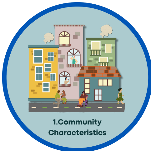
1. Community Characteristics

Consider a community with few native English speakers, little representation in local government, high rates of asthma, and poor air quality.